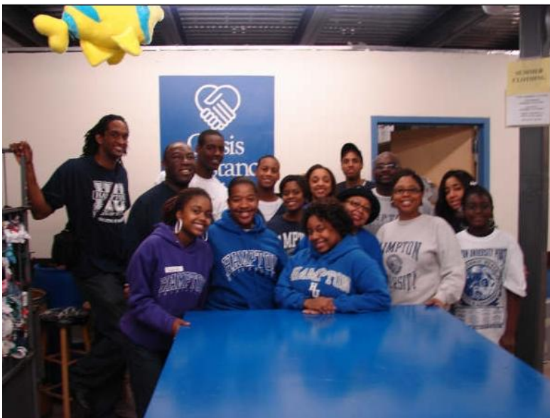
*Chapter Members at Crisis Assistance Ministry on March 8, 2008*